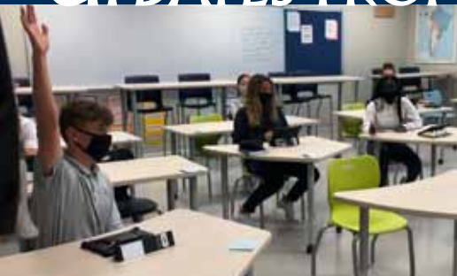
Students engaging in in-person learning distanced in a reduced-capacity classroom while students in the same class (in the opposite cohort) join virtually.